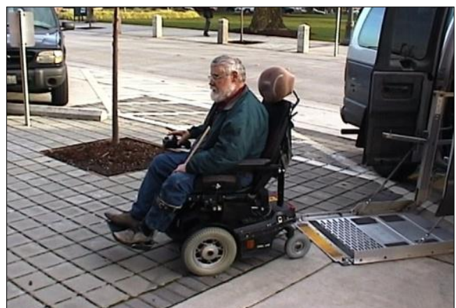
Businesses in Southgate Mall scored an A (3.81 rating, 95% score).

We examined businesses by locations: Southgate Mall, downtown, and other locations. Graph 2 presents the average access scores of the businesses by location. Overall, businesses located in Southgate Mall were significantly more accessible than those located in other areas of the city. While Missoula averaged 3.32 on our 4-point scale, businesses at Southgate Mall averaged a rating of 3.81 and a score of 95% for a grade of an A.