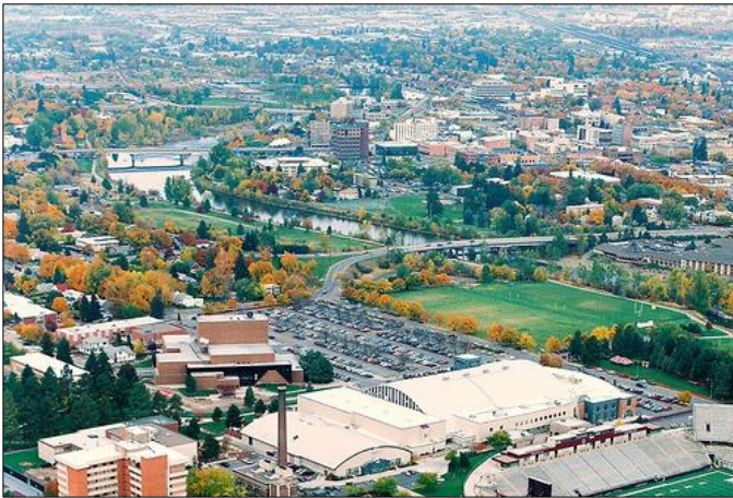
Missoula scored 3.32 out of 4 for a grade of B.

To determine a town's accessibility, we rate parking location and signage; safety and accessibility of route to the business' entry; parking accessibility; and the accessibility of a business' entry, door