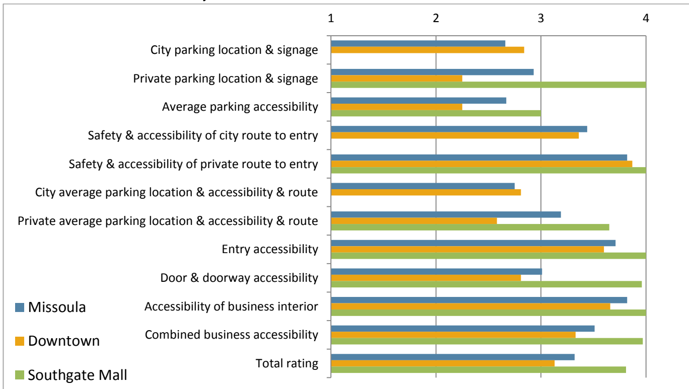
Graph 2: Missoula Business Accessibility

No matter how they were examined, 90% of the businesses accessed by a private route had a clear, accessible, and safe route to the business.