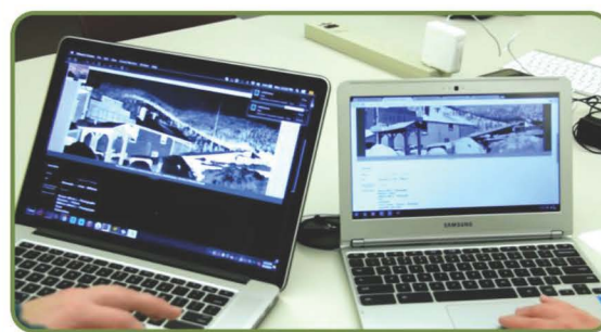
JAWS Screen Reader and Camtasia Relay