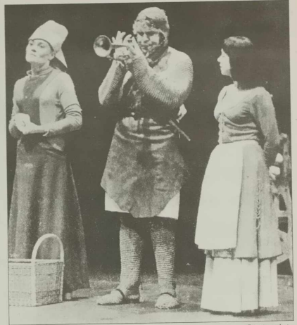
THE NEW VIC THEATRE will perform "Canterbury Tales" in the University Theatre tonight at 7:30.

Spring Fest Information Number 821-3508 Bus Reservation Number 523-5595