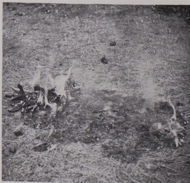
A warming fire left burning starts creeping in forest fuels

Table 1 shows fires by years and causes. Careless smokers are responsible for the greatest number of fires. Wildfires resulting from camp and warming fires are next. Many of these are hunter fires that occur in the fall of the year when fuels are dry and protective forces are reduced to minimum standards. The only significant trend during this period has been a reduction in the number of railroad fires. This is due to the increased use of diesel locomotives and a concerted effort on the part of the railroad companies to reduce this type of fire. There have been a few more lumbering fires in the latter part of the period, due mainly because of the great increase in logging since 1950.