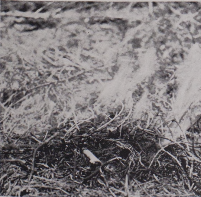
A cigarette carelessly tossed into the dry grass starts a fire

Fire occurrence is of course influenced by weather, fuel, and topography. There are many instances where fires either started or did not start depending on the severity of burning conditions at the time, there being an igniting agent present. Nevertheless, two items are increasing: —Man's use of the forest and money spent on fire prevention. Since there is no striking downward trend in the total number of man-caused fires, it behooves us to be as effective with fire prevention