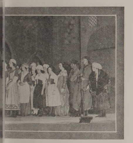
imunity Production. The scene was made ompany numbered 250 people, including 150