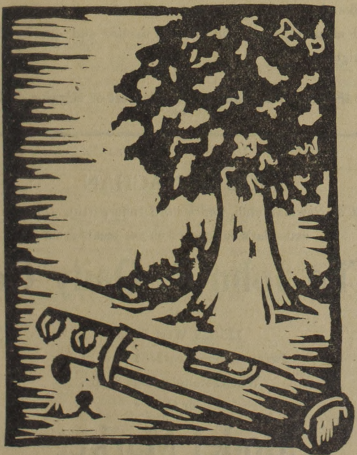
Boy and Girl Playing Golf