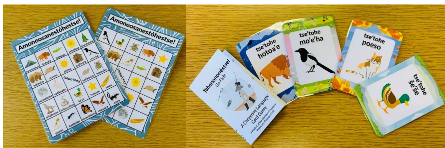
Bingo cards in Cheyenne (left); Go Fish Set in Cheyenne (right) created