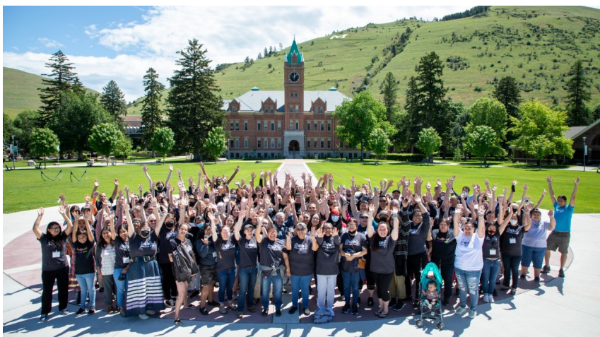
Image: CoLang 2022 attendees on Oval, the University of Montana. June 24, 2022.