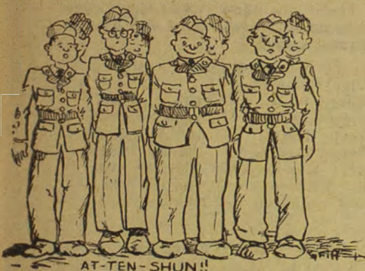
Co-Ed Colonel Judges