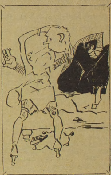
An evening in the Student Union lounge.