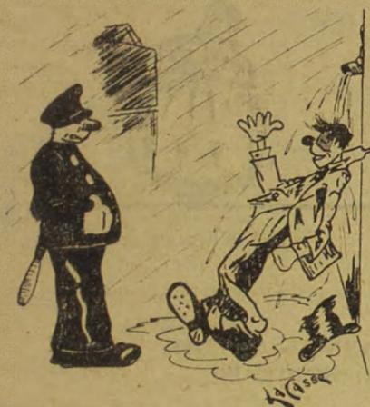
Silent Sentinel's Prexy