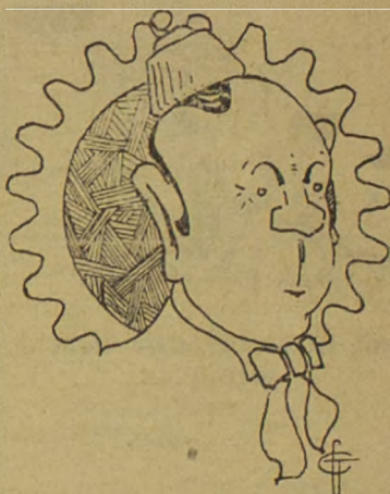
Montana's China Boy