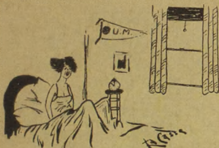
Latham awakening after night of forgetting all.