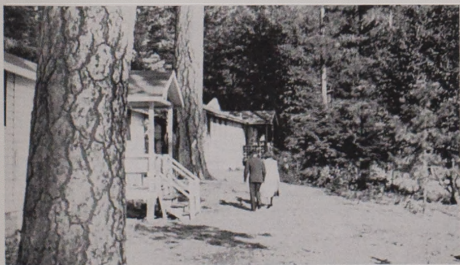
Highline Trail, Glacier Laboratories