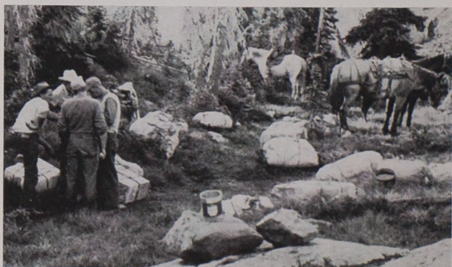
Mission Pack Trip