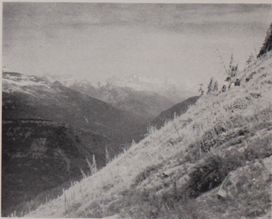
Hiking along Garden Wall Trail in Glacier Park