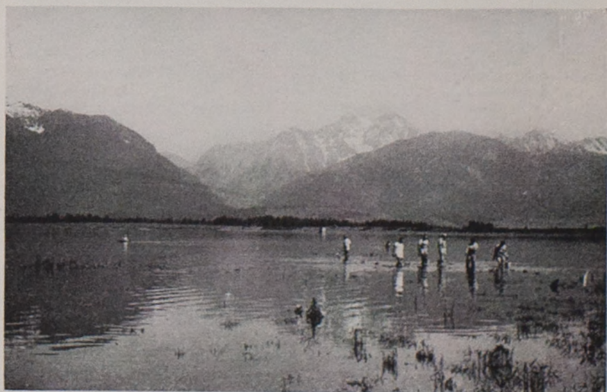
Aquatics Class at Kicking-Horse Reservoir