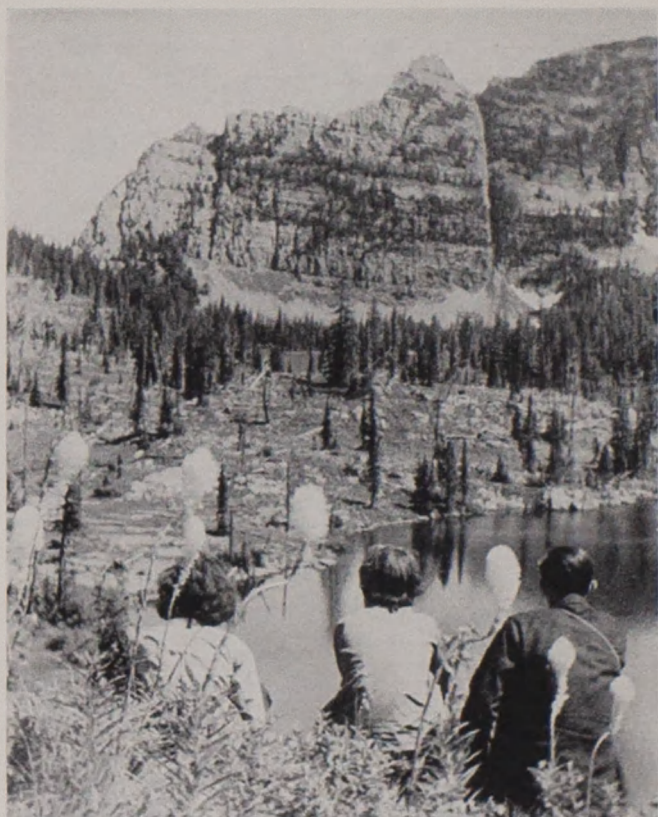
Mollman Pass in the Mission Mountains