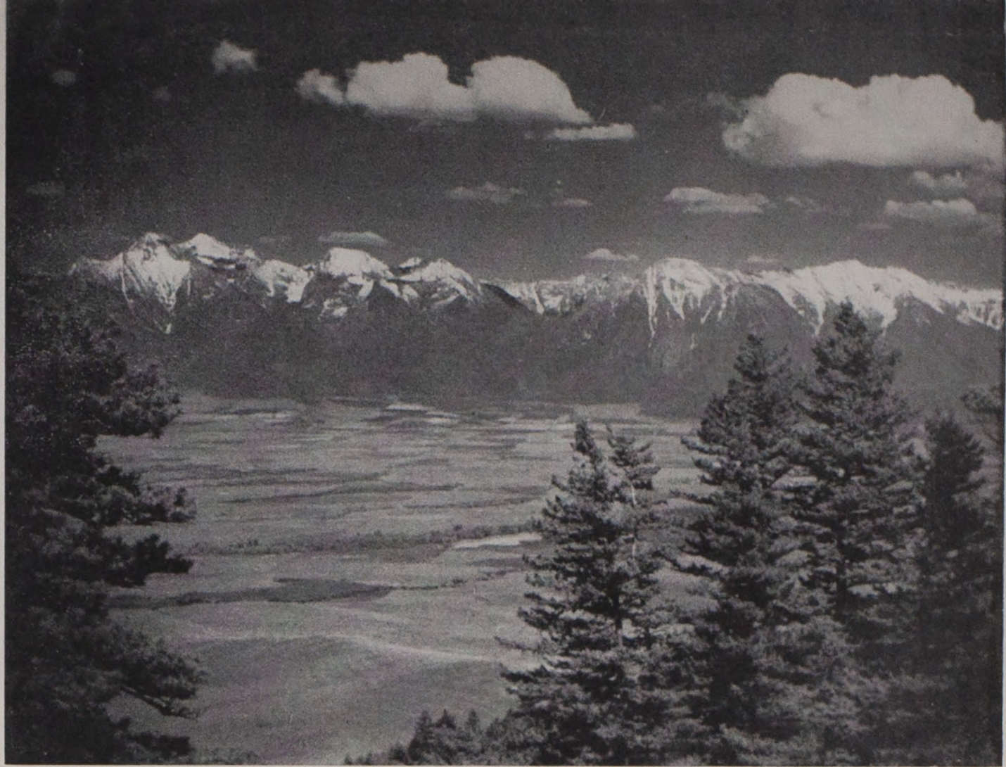
The Mission Range