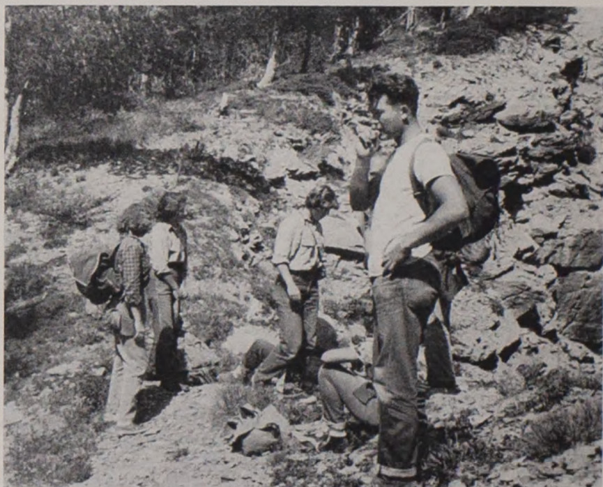
Rest Stop En Route