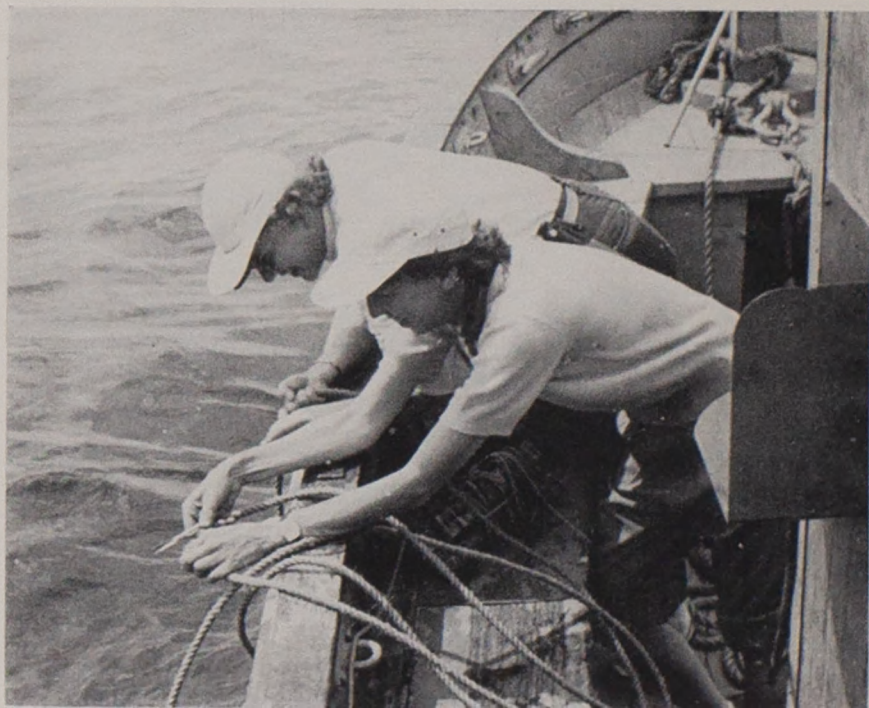
Special Investigators Working from Launch