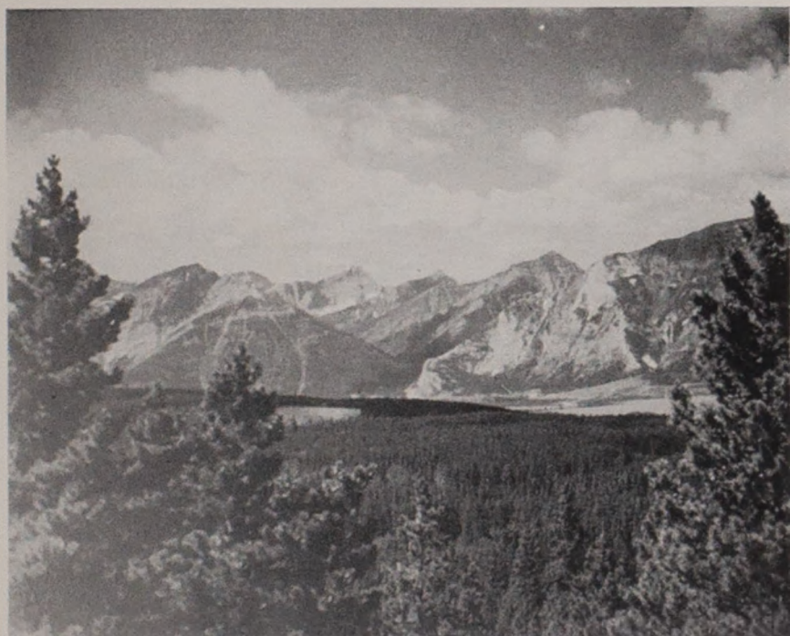
Waterton National Park—Base of Many Activities