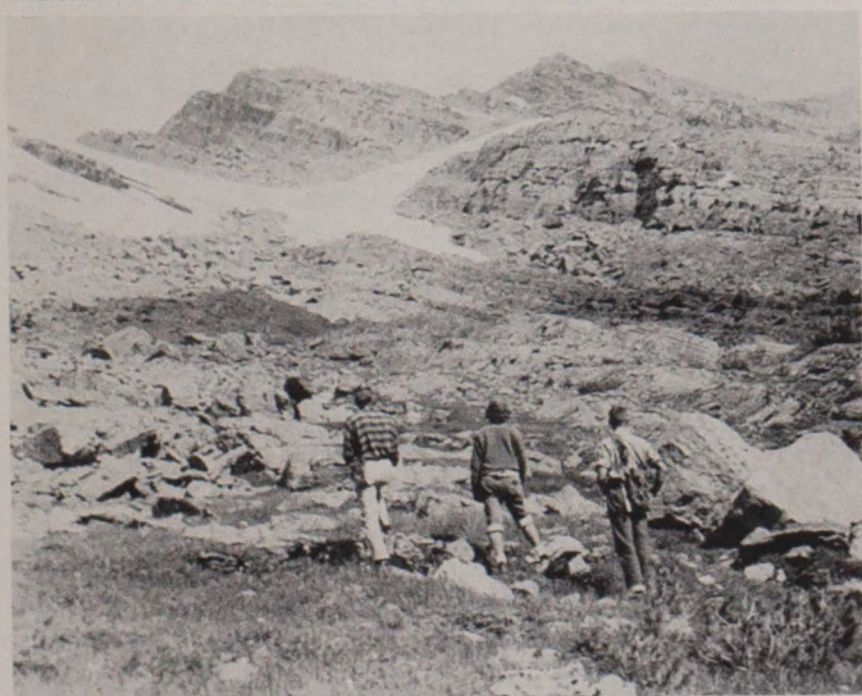
Post-session Trip into Mission Mountain Primitive Area