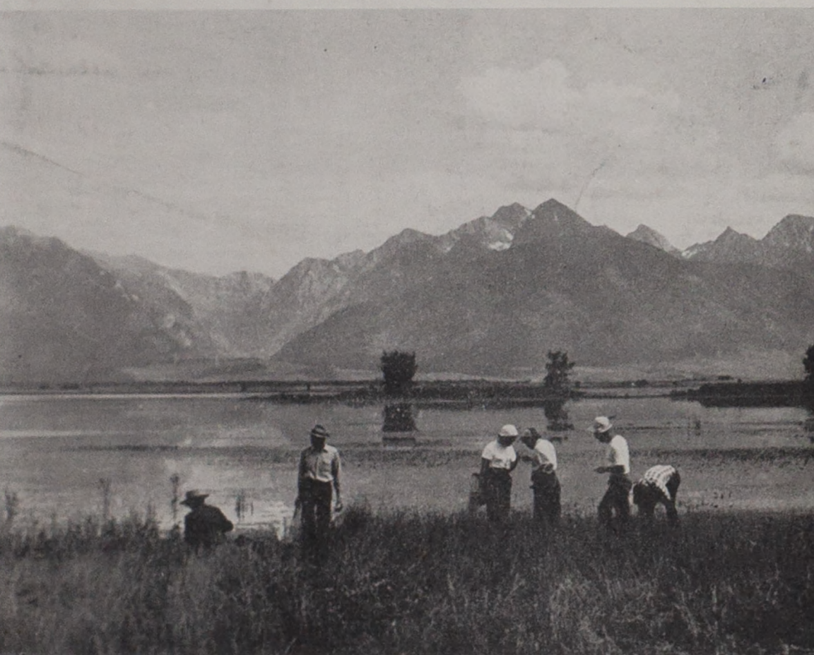
Nine Pipes Migratory Bird Refuge and Mission Mountains