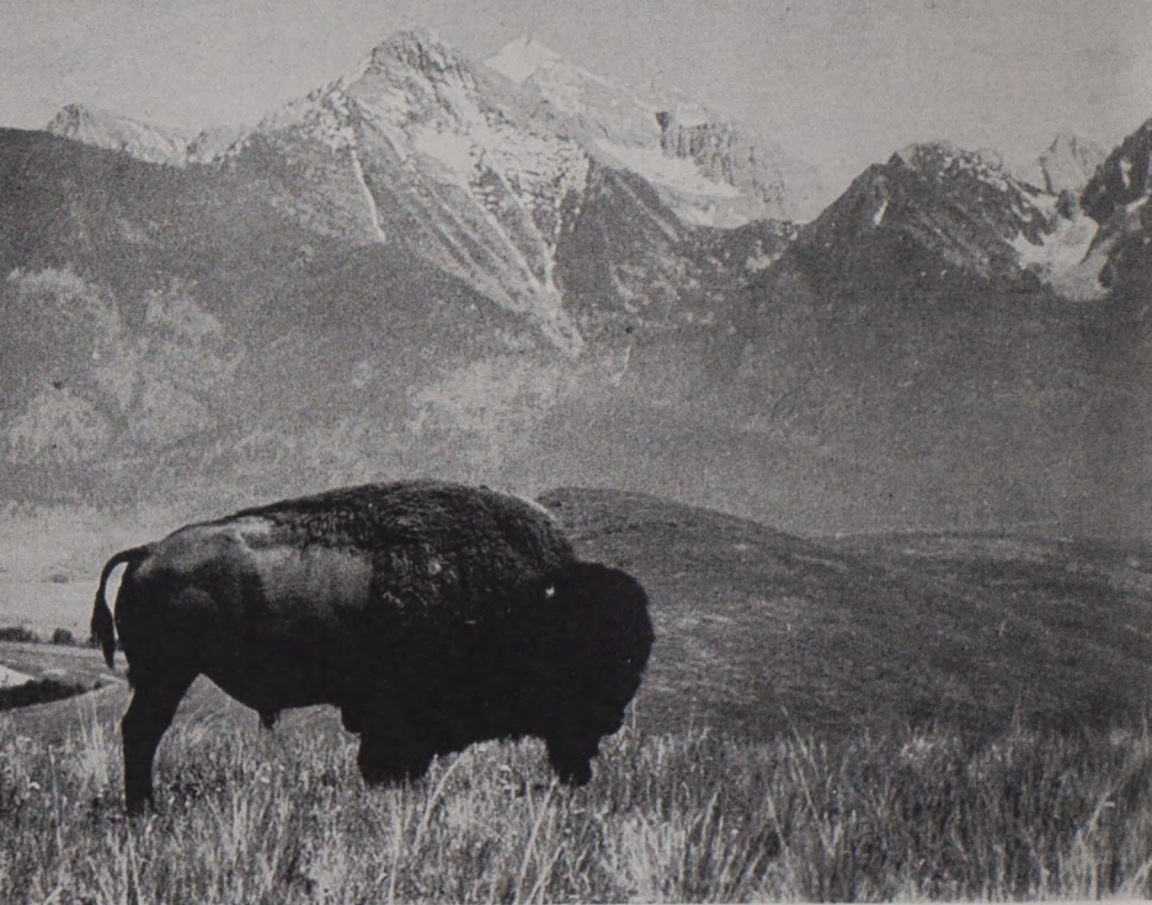
One of the patriarchs of the National Bison Range