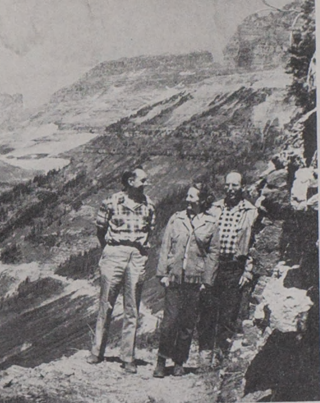
On the Garden Wall trail above Going-to-the-Sun Highway in Glacier National Park