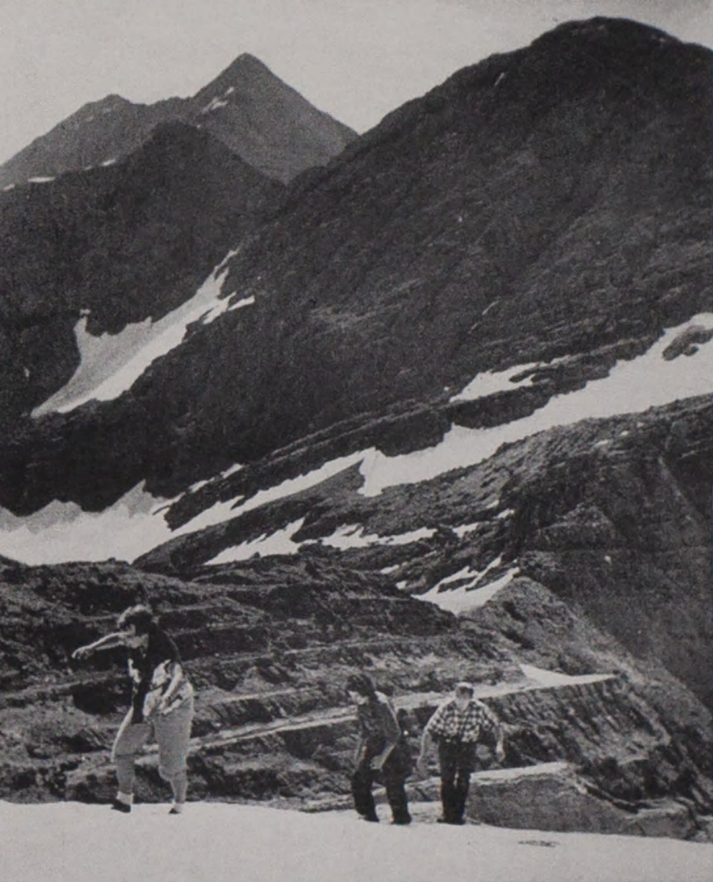
Crossing permanent snow field on climb to top of Missions during traditional post-session trip.