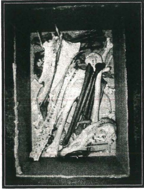
Before: goose skeleton in old cardboard box.