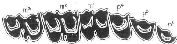
Upper tooththrow of Bison