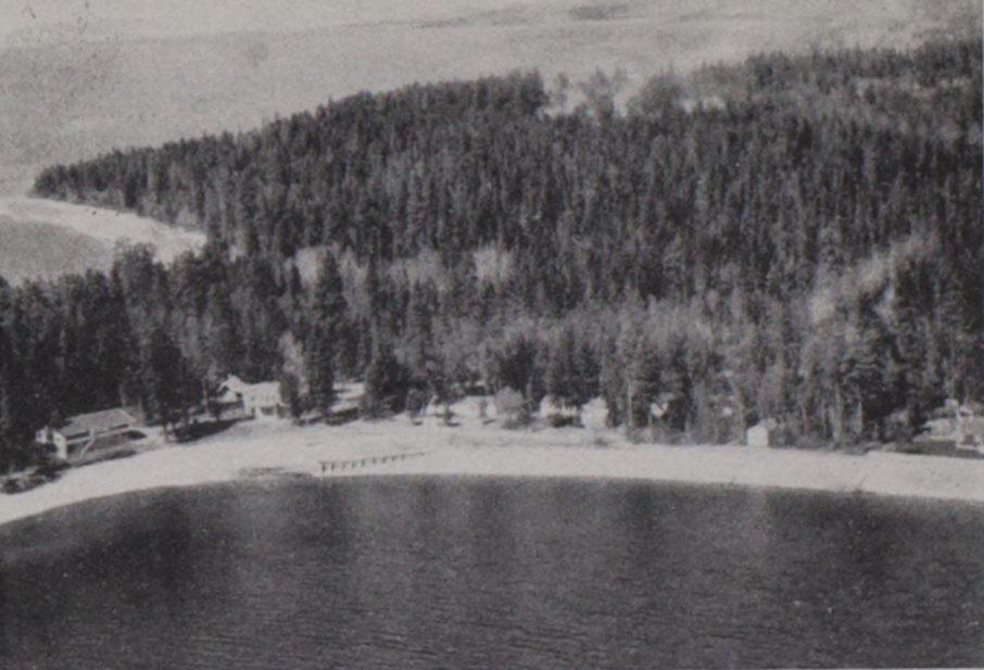
Aerial view of MSU Biologi- cal Station, situated on Yellow Bay Flathead Lake, Montana