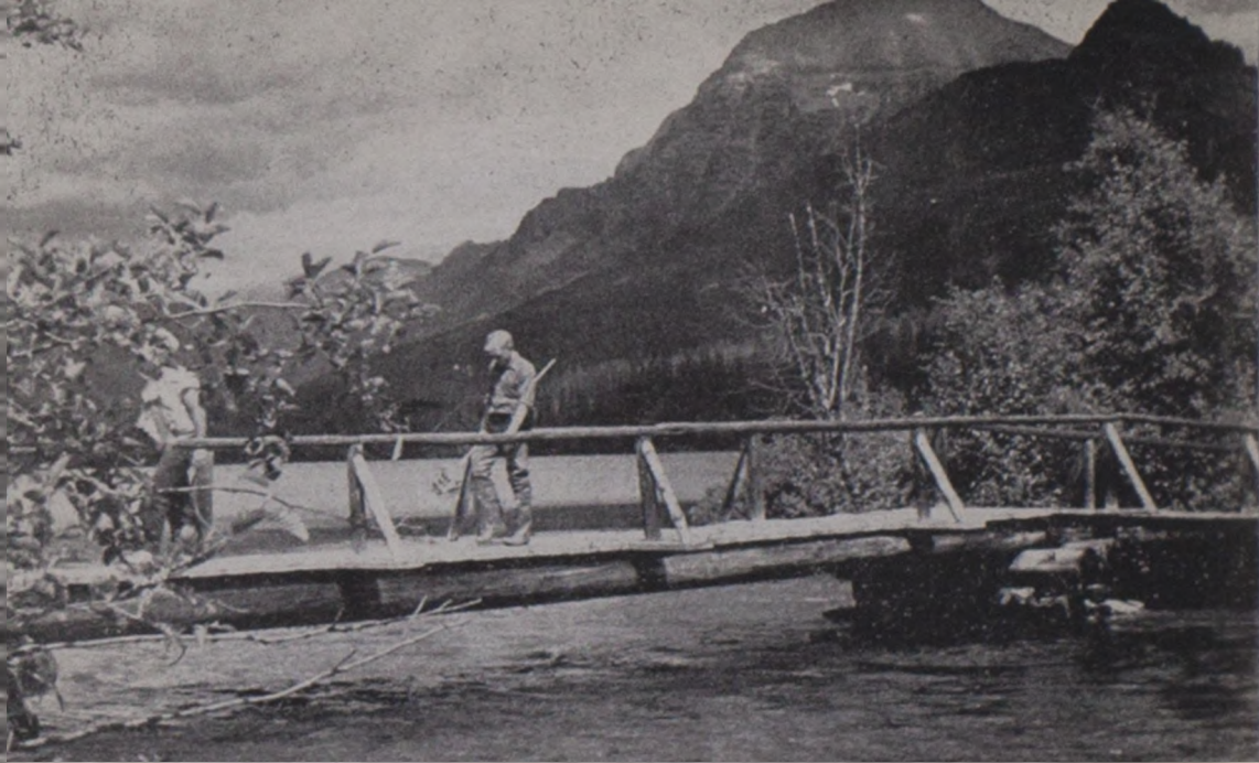
COLLECTING AT BOWMAN LAKE