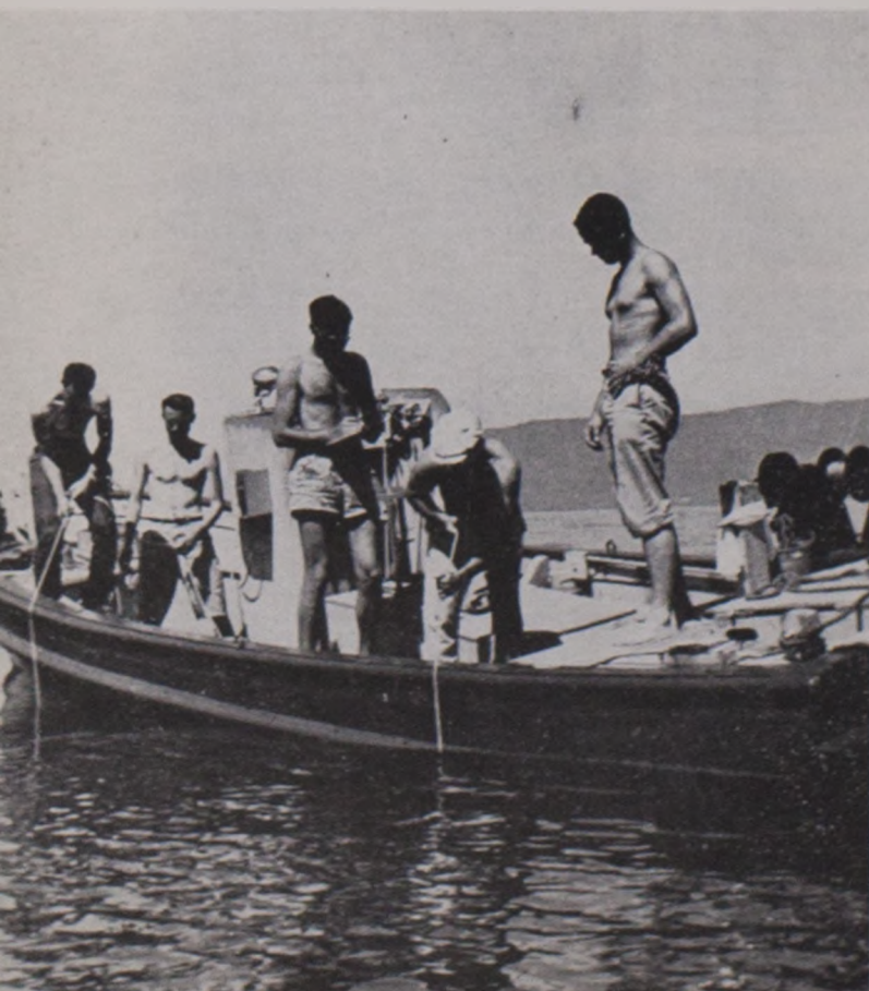
LIMNOLOGY CLASS ON FLATHEAD LAKE