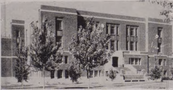
Student Union Building