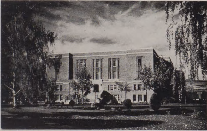
Student Union Building