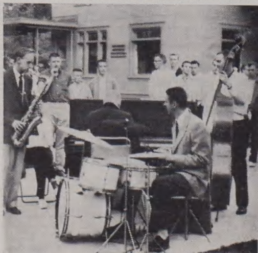
Street dance: another popular Inter-scholastic activity.