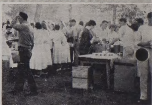
Barbecued beef and lots of fellowship on the U oval.