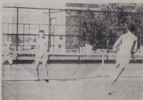
Tennis doubles team in action.