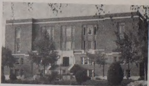
The Fine Arts Building houses both the University Theater and the Masquer Theater, headquarters for the Little Theater Festival.