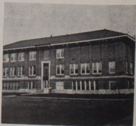
MSU's "justly famous," according to John Gunther's "Inside U.S.A.," School of Journalism is home to the student daily newspaper, the Kaimin, and the MIEA events and meetings.