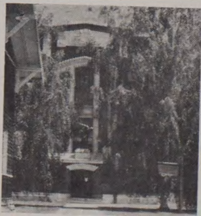
Once the home of the Grizzlies, the Men's Gym now houses the Physical Education Department. It is headquarters for track and field events for the 55th annual Interscholastic.