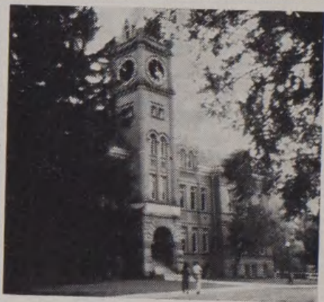
The original home of MSU, Main Hall is the Administrative seat of the University. Standing at the top of the Oval, the tower houses a memorial clarion.