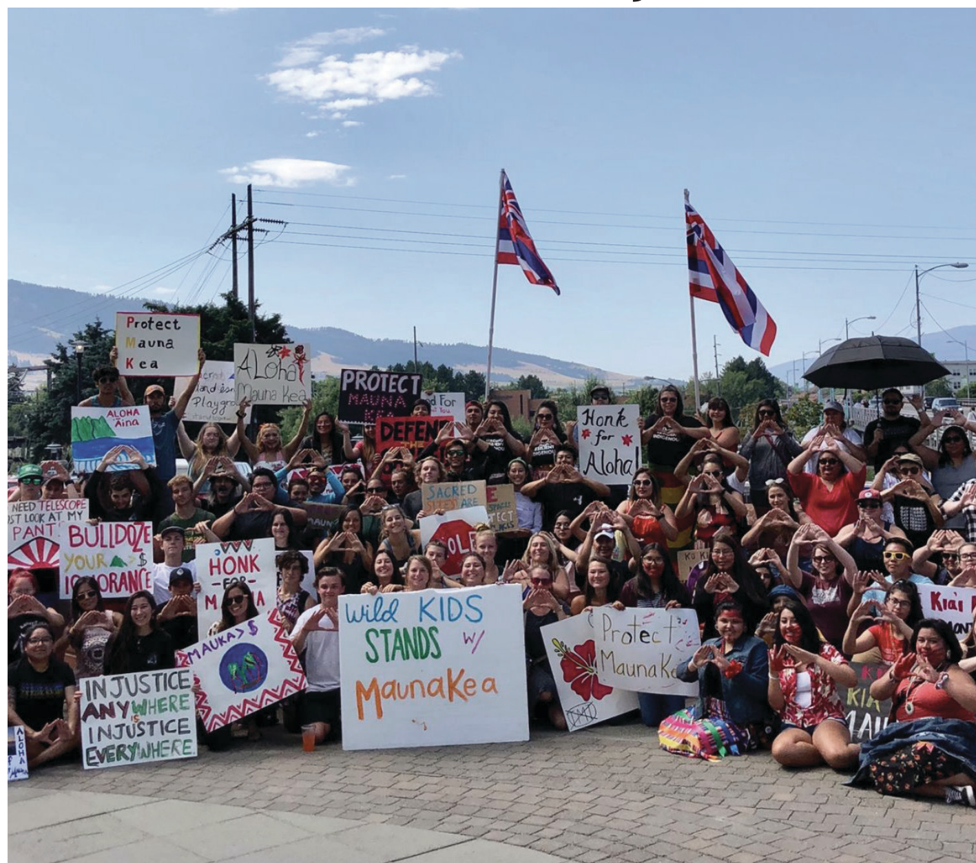
Members of the University of Montana Pacific Islanders Club participate in a protest for Mauna Kea, Hawaii in Missoula, Montana on July 29, 2019.

CONTRIBUTED BY THE UNIVERSITY OF MONTANA PACIFIC ISLANDERS CLUB