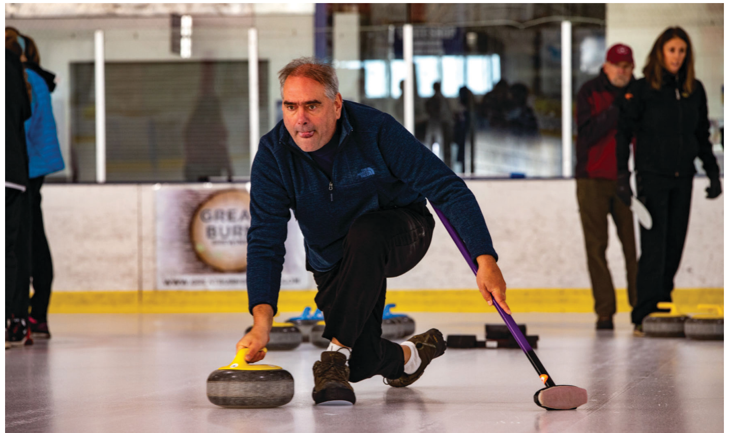
An aspiring curler prepares to launch a stone down the ice.