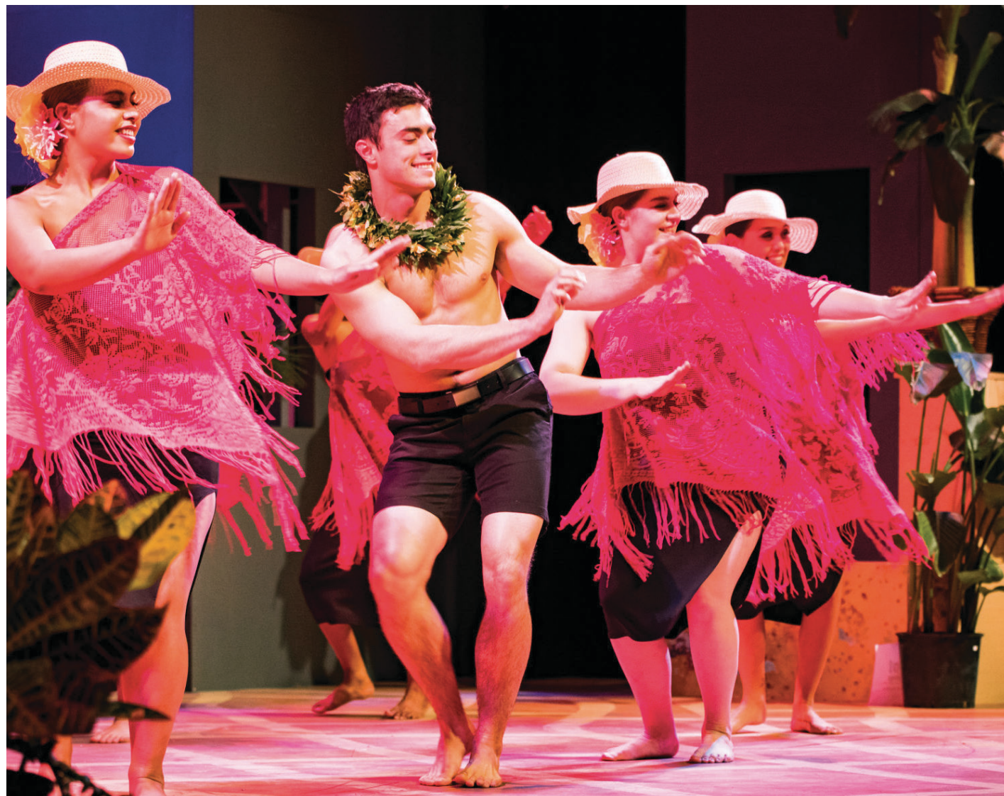
Members of the Pacific Islanders Club perform on stage at the Missoula Children's Theater for their first annual Luau on April 14.