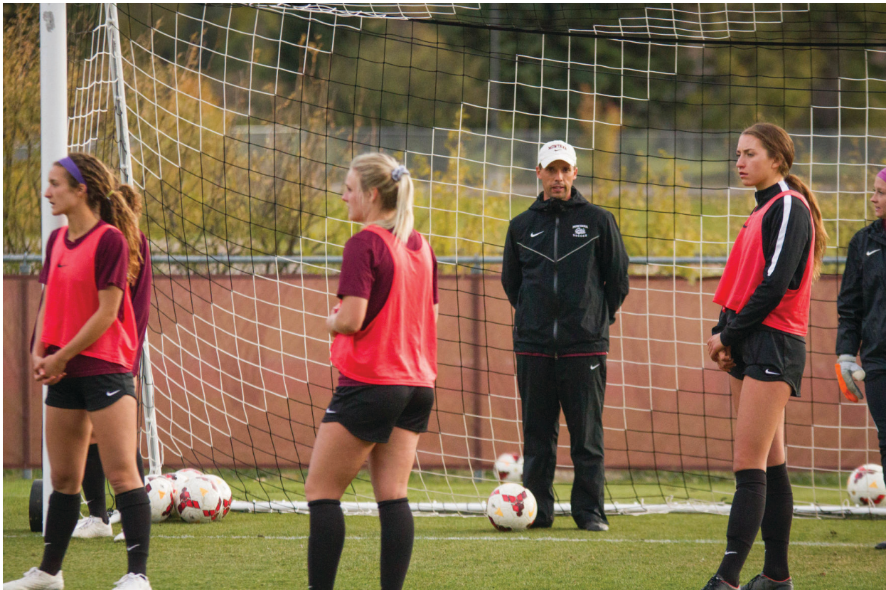
Citowicki watches the Griz soccer team prepare for a corner-kick drill during the team's final practice before its matchup with Sacramento State.

Many immigrants today have trouble obtaining a green card to set themselves up to become a citizen. According to Haque, it is not easy for immigrants to attain citizenship in the U.S. right now, and it's even harder for refugees.