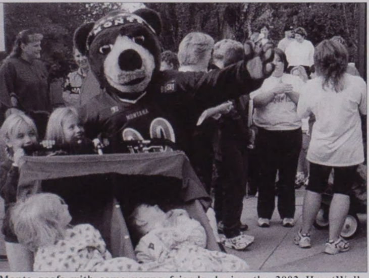
Monte goofs with some young friends during the 2002 HeartWalk.

Team leaders can set up a Web page or find out more information at www.kintera.org/faf/home.