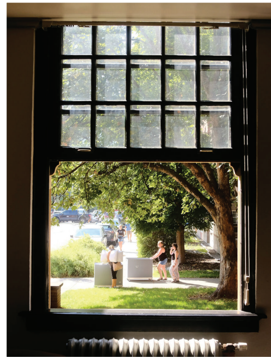
Parents and students push carts of full dorm furniture during move in day.