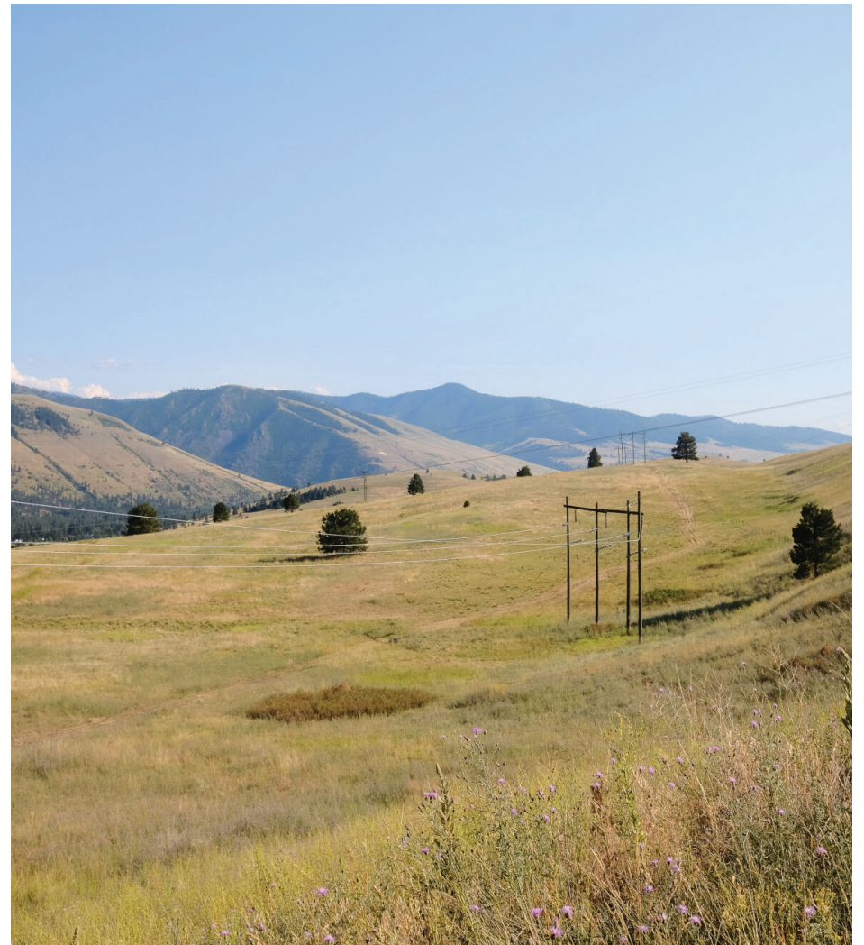
Waterworks trail pictured on July 24.

Do not fret, with this guide you'll be prepared for anything. Just remember to bring a pair of hiking boots (preferably waterproof), bear spray, water and lots of granola bars before you get out there. Best of luck and happy hiking!