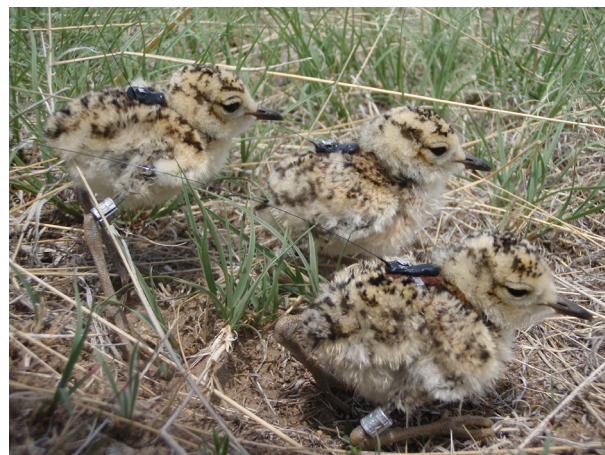
Figure 1. Mountain plover chicks ( Charadrius montanus ) fitted with radio transmitters and metal bands for survival estimation (Photograph credit: Colorado Parks and Wildlife).

We measured several covariates that may impact the age-specific mortality hazard rates: chick size at marking measured via mass and tarsus length of chicks, nesting habitat type, year of the study, sex of the chick (male = 1), and sex of the attending adult (male = 1). Habitat types were classified as grassland (reference state),