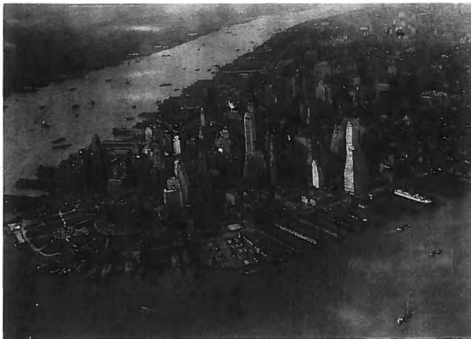
Figure 3. In 1940 New York was the world's largest city, with 7.4 million inhabitants. By 1997 it had dropped to tenth, replaced by Seoul, South Korea's 10.2 million residents. The global population has grown rapidly in the past 50 years. Consequently, humanity's impact on the environment is increasing. We need to understand the environment to accurately judge the effect we have on it.

Documenting and monitoring biospheric health, just like human health, should not be a political topic. Biospheric health, and more specifically the sustainability of human life on planet Earth, is a topic that cuts across liberals and conservatives,