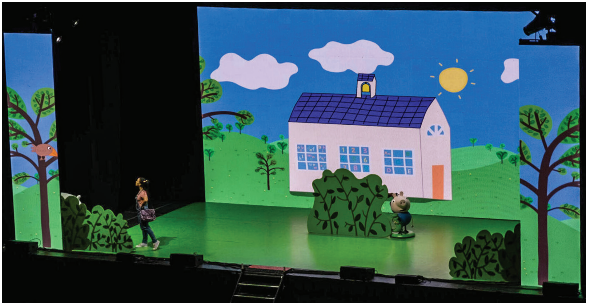
The "Peppa Pig" tour made its way to the University of Montana on Tuesday, Nov. 29. Children in the audience enjoyed the performance while our reviewer recalled pig-centered nightmares.

Maybe "Peppa Pig's Adventures" should model themselves after "Winnie The Pooh" and become a cheesy horror movie instead.