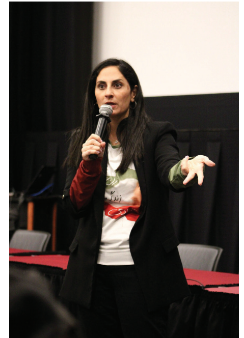
UM provost Pardis Mahdavi leads a town hall on Nov. 29 to try to clear up some of the confusion surrounding the proposed academic renewal.

Breuner pointed out that rearranging departments could place faculty researchers side by side with people who didn't know