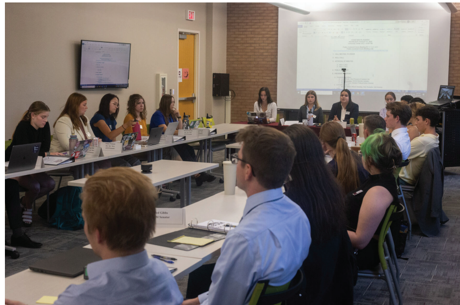
The members of the ASUM senate begin with opening remarks, roll call for members and addressing the minutes of the end of term meeting from spring on Aug 31.

She added she did not have the authority to step in and correct any violations.