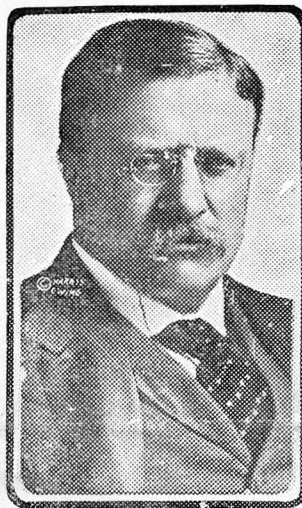
Ex-President Theodore Roosevelt.

Tuesday, April 11, is the big day. The people of Missoula, as well as the University, should consider themselves very fortunate in having ex-President Roosevelt here at that time, because he is making only two stops in Montana. The exercises in University Hall