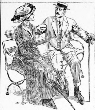
Copyright 1911 by Alfred Benjamin Co., New York

Young Men— Ask to see the Sophomore suit