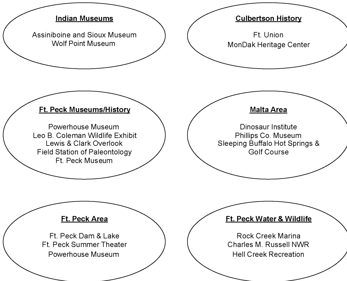
Figure 1: Groups of Attractions Visited – Results of Factor Analysis

A factor analysis was conducted with attractions where more than ten people visited and a few patterns emerged (Figure 1). Factor analysis attempts to identify underlying variables, or factors, that explain the pattern of correlations within a set of observed variables. Factor analysis is often used in data reduction to identify a small number of factors that explain most of the variance observed in a much larger number of manifest variables 1 . In this study, attractions visited by respondents tended to group together by geography such as those located in the same community, or by theme (e.g., culture, history, etc.). Interestingly, three of the attractions with greater than eight visitors did not group together with any other attraction indicating that these are more likely to be stand-alone sites. Those three attractions were Glasgow's Valley County Pioneer Museum, the Pioneer Town and Museum near Scobey, and Malta's Bowdoin National Wildlife Refuge.