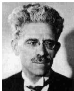
Maurice Fréchet (1878–1973)

TOPICS: 1. The Real Number System 2. Metric Spaces 3. Sequences and Series of Functions 4. Lebesgue's Theory of Integration