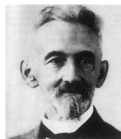
Felix Hausdorff (1868–1942)

In his thesis of 1906 Maurice Fréchet first introduced the notion of a metric space. In 1914 Felix Hausdorff published his famous Grundzüge der Mengenlehre in which the theory of metric and topological spaces was further developed.