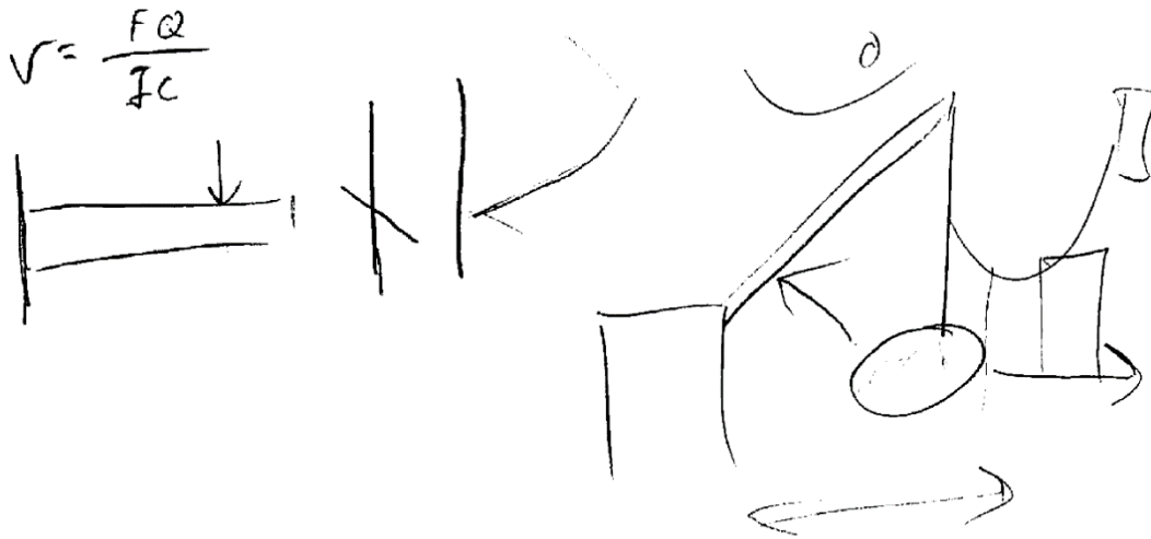
Figure 2 Undergraduate engineering student's work on #7, the Wrecking Ball.

Thus the task evoked the intended transitions in the modeling cycle, understanding and simplifying/structuring and due to the student's recent study of materials and statics, he was able to recall a related formula.