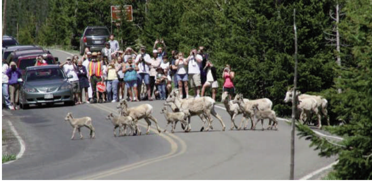
Fig. 1. Traffic is halted to allow a group of bighorn lambs and ewes to cross a main park road. Bighorn sheep congregate at a natural mineral lick intermittently from May to September each year in Rocky Mountain National Park, Colorado. The road separates the mineral lick from the rest of their range.