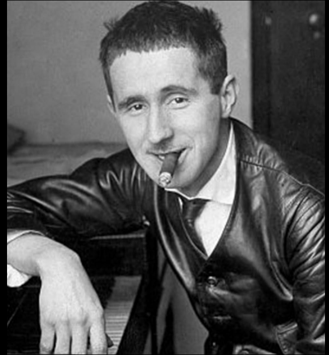
Bertolt Brecht, 1927.