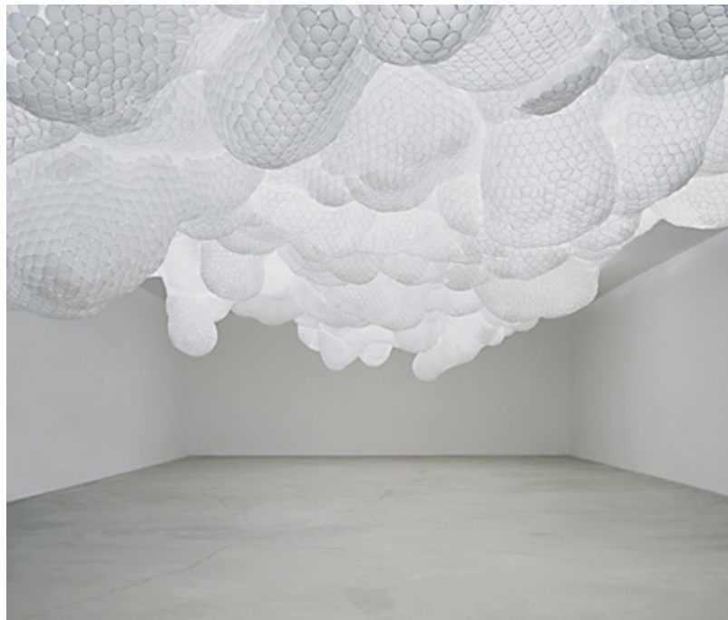
Tara Donovan, Untitled (Cups) , installation of plastic cups, 2006

Haze , 2003, an installation of plastic straws, the kind you would find at any generic fast food restaurant in America. Lilly Wei described the work, ( Art in American , July 2003) “. . . it looked like a wall-to-wall cloudbank, extending forty-two feet laterally and climbing twelve-and-a-half feet, its ruffled upper edge incandescent, rimmed by light. . . between the audacity of the scale and the simplicity of the concept, something uncanny occurred.” 20 Donovan’s work typically utilizes an accumulation of unaltered ordinary objects to draw on the recently established legitimacy of the readymade object while referencing meditative processes of repetition.