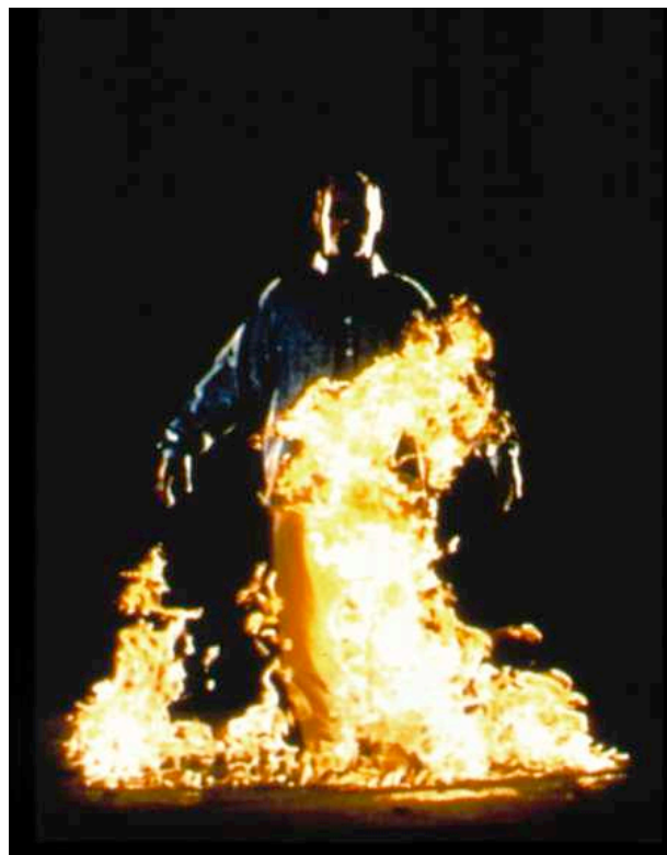
Bill Viola, The Crossing , synchronized color video installation, 1996.

conceptual aesthesis. In the last decade, considerations of art's material qualities have become germane to developments in photographic art-making practices and the general acknowledgment of equality between images developed by traditional means, with the use of film and darkrooms, and images that are digitally produced and printed with the use of computers. There is a difference in the feeling of the work. For one, it exists in time, more like performance. It is also developed through the requirements of technological processes that impact its final look. There is an inherent difference in objects that originate through different processes, yet the removal of the artist's hand in the work does not categorically lead to a distancing effect. These aspects of materiality are available for interpretation upon viewing as visual effects that bring awareness to the art-making process and establish the link between what the work is, and what it means.