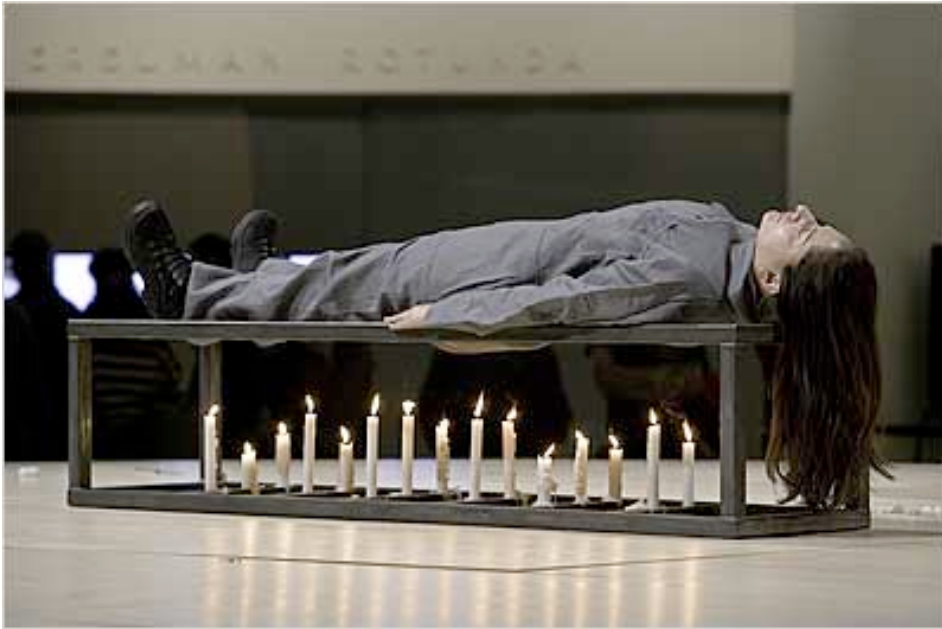
Marina Abramovic, The Conditioning of Gina Pane , 1973

another aspect of meaning. Art provides a unique means by which we can explore these intangible realms with no immediate consequence . Works of art, though they provide reference points and impressions, exist outside of ordinary experience.