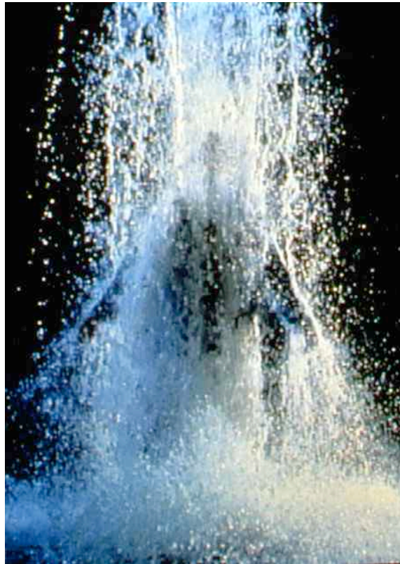
Bill Viola, The Crossing , synchronized color video installation, 1996

A way of viewing the world is revealed when it has jelled and thickened into a kind of spiritual artifact, and despite the philosophical reminders our self-conscious cineastes interpose between their stories and their audiences, their vision—perhaps in contrast with their style—will take a certain historical time before it becomes visible. In whatever way we are conscious of consciousness, consciousness is not an object for itself; and when it becomes an object, we are, as it were, already beyond it and relating to the world in modes of consciousness which are for the moment hopelessly transparent. 21