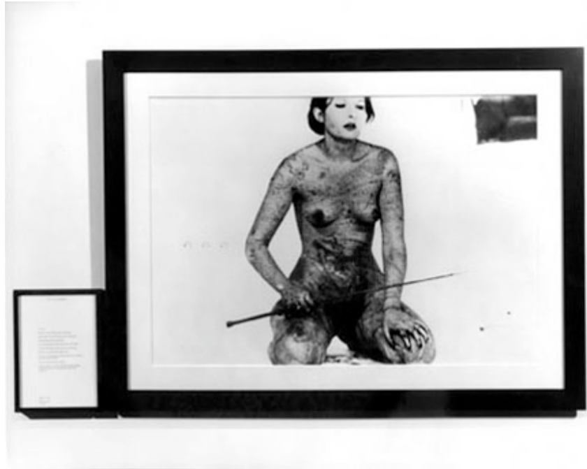
Marina Abramovic, Lips of Thomas , performance, 1975