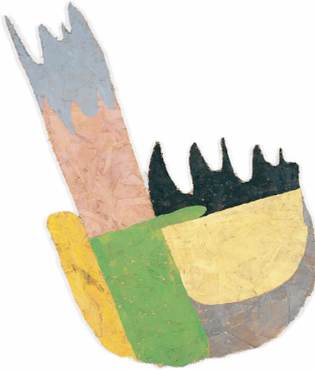
Richard Tuttle, Waferboard 4 , acrylic on waferboard, 1996