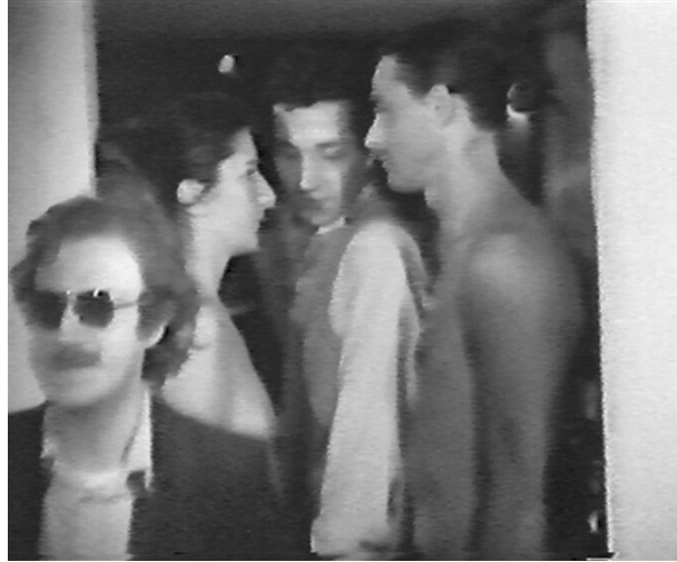
Marina Abramovic, Imponderabilia , performance, 1977

By locating the viewer within his or her personal experience, Abramovic's performances provide a heuristic experience, an experience of learning through doing. In Imponderabilia , 1977, she and her partner, Ulay, stood opposite one another in a hall leading into the gallery hosting their exhibition. The artists, a man and woman, were nude. The close quarters of the hall required that those entering the space in order to view the "show" squeeze past the artists, choosing which to face, ostensibly confronting their internal responses to the unpredictable, even anarchic, situation. In the case of Abramovic, as with much performance art, the work's materiality is an extension of the artist's willingness to transform her body into the object or vehicle of meaning. Abramovic seeks a visceral, emotional response. In most cases, she is unsure of what will transpire in the course of the performance.