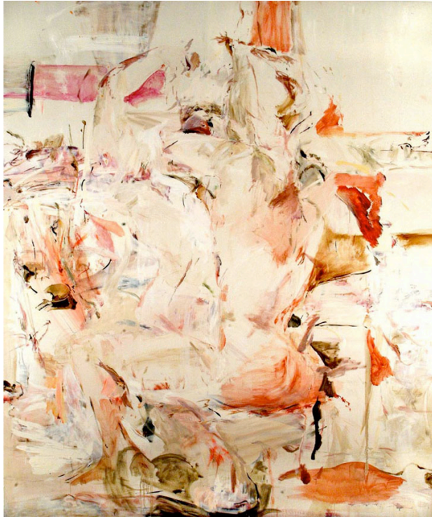
Cecily Brown, The Fugitive Kind , oil on linen, 229 cm x 190.5 cm, 2000

While the artist makes deliberate decisions to utilize particular materials in a particular fashion, there is an acknowledgement that an ineffable quality of “letting be” must come through to the viewer in works of art that we want to return to again and again as they reveal that mysterious sense of embodiment and the perpetually surprising ability of inert material to encompass more than empty form.