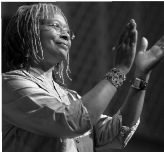
This is a photo of Alice Walker, a Pulitzer-prize winning novelist and poet.

Class absences can be excused if proper document from medical, athletic, or administrative officials is supplied. You will be counted as late if you are more than five minutes late for class and be marked down for that day's class participation grade. Attendance is recorded weekly on the class Moodle site.