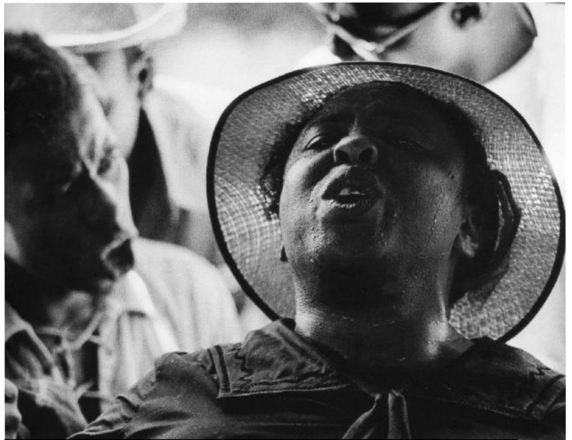
This is a photo of Fannie Lou Hamer, an important civil rights movement organizer, leading freedom songs.