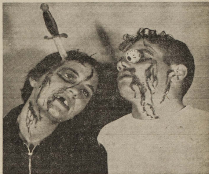
TOO STRICT????—"Don't you think that we were too strict with them, Dean?" "No, they were 10 minutes late weren't they?" "But they seemed a little upset about the four quarter campus ruling we gave." It's just a phase all children go through. They'll get over it in a few years."

In response to New York's triumphant ticker-tape parade for U. S. astronaut John Glenn, Soviet Premier Nikita Khrushchev announced today that Yuri Gagarin, Russian cosmonaut, will be accorded a parade through downtown Moscow, complete with radioaktive fallout.