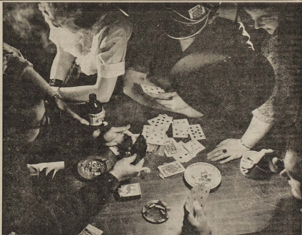
ASMOO HARD AT WORK—The photo above was taken during Centrally Bored's meeting last night where preliminary plans were outlined for the visit of the State Bored With Education tomorrow on the MSU campus. Centrally Bored members