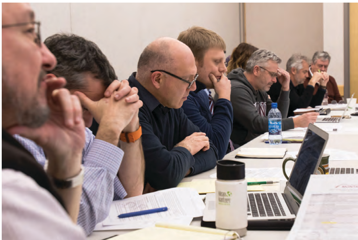
University Planning Committee board members take notes during a weekly meeting in a UC conference room March 9.