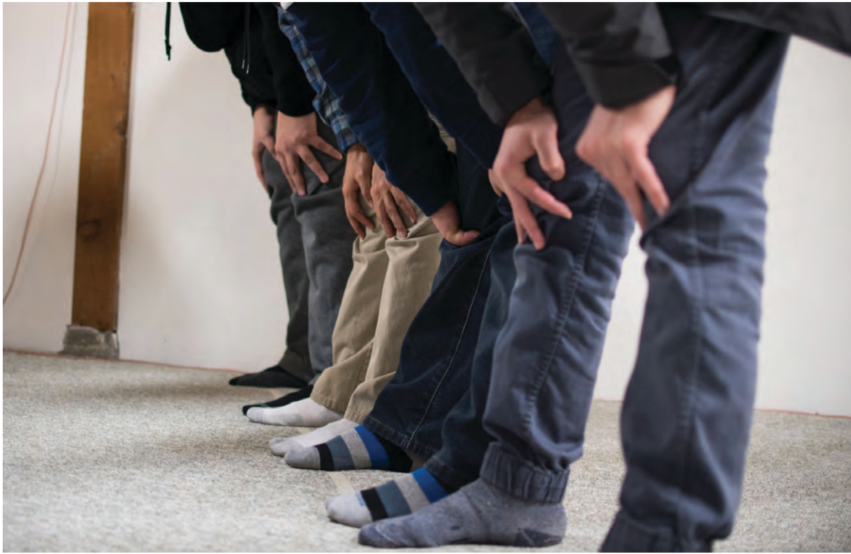
Men perform ruku, or bowing, in the middle prayer. When doing ruku, you are supposed to bend at the waist until your palms reach your knees and remain in that position until you feel calm.