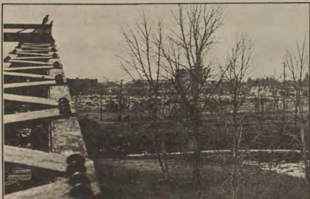
TWO REAL ESTATE AGENTS want to make a seven-mile parcel of riverfront property public land.

Also, Brugh and other Missoula investors have purchased the old Milwaukee Depot and nine surrounding acres. Plans for the depot include a restaurant and offices.