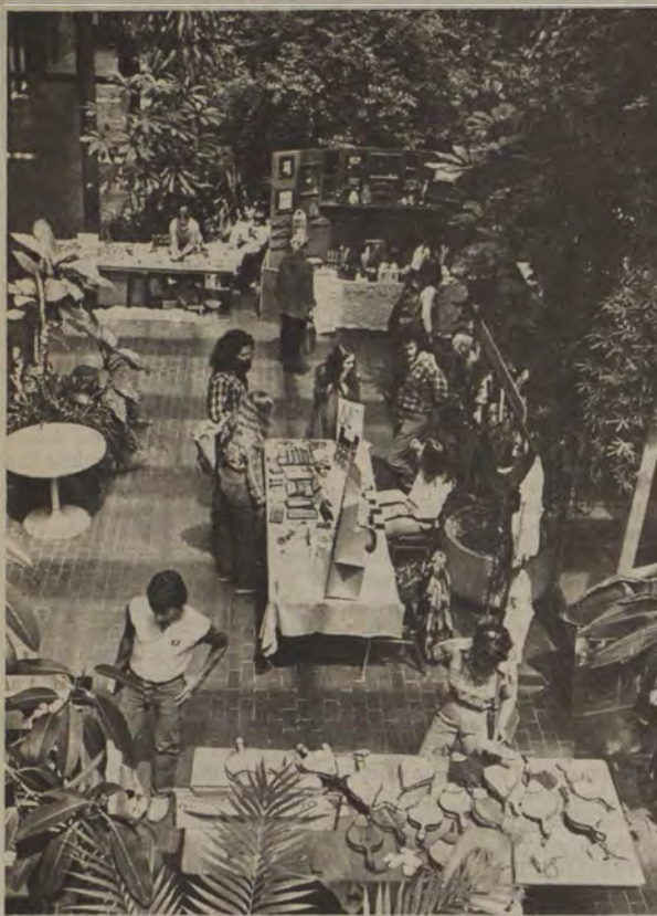
THESE PEOPLE ENJOY THE INDOOR CLIMATE OF THE University Center Mall while browsing around the art fair that will be in the Mall through Friday. For today's weather, see page 8.

Wednesday, May 20, 1981 Missoula, Mont. Vol. 83, No. 101