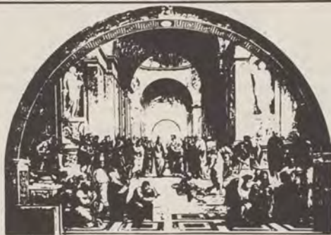
THE PRESIDENT'S LECTURE SERIES: