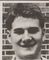
Column by Jason Loble

Practical jokes, though, can get pretty mean and destructive. So, some good clean fun must be had by dorm residents also. Winter months are best for indoor creativity.