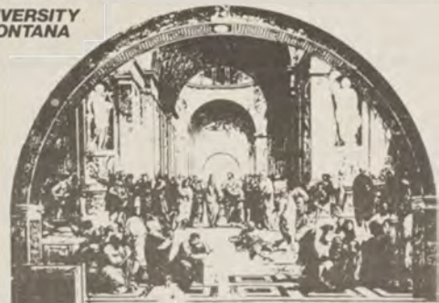
The President's Lecture Series 1988-1989

This year's Series of President's Lectures will consist of eight talks on vital topics by distinguished guest speakers. The University community and general public are cordially invited to attend all of the lectures. Admission is free.