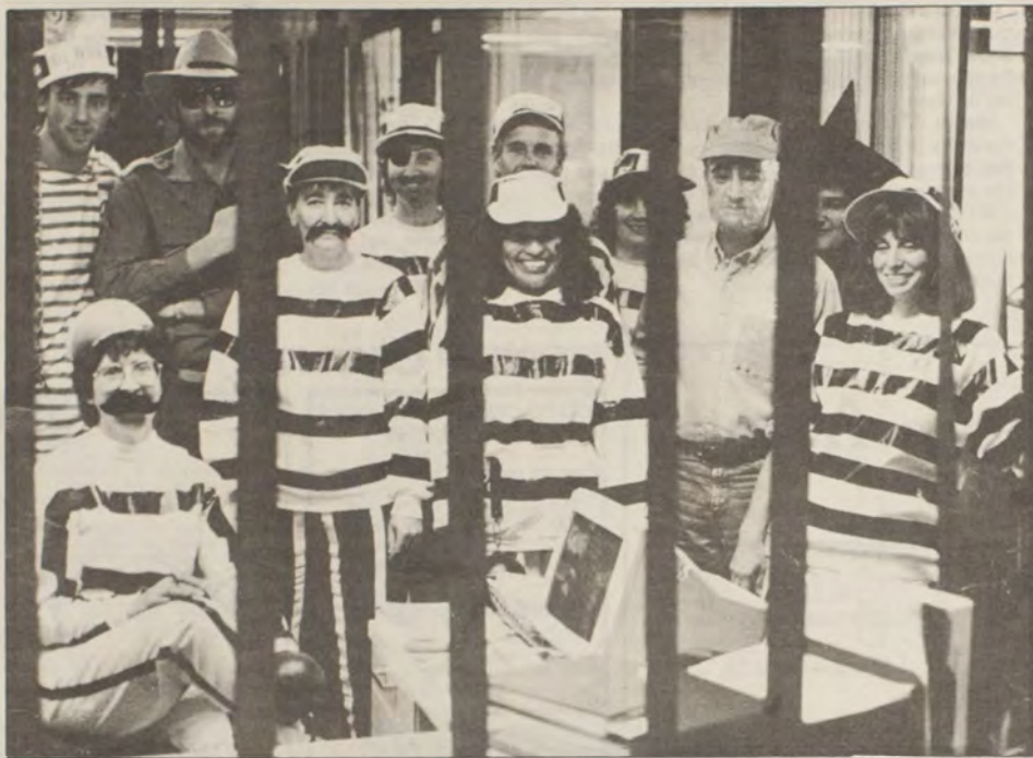
THE HARD-working staff of the admissions office went behind bars to win the Lodge costume contest Monday. Financial aid employees, the challengers, provided a plateful of brownies to the incarcerated.