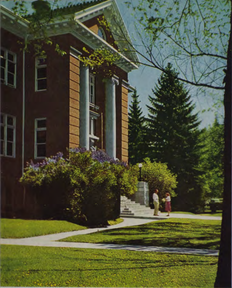
QUIET SUNDAY STEPS, resting from people . . . two on a walk; the sunny days with no general purpose . . . the Law building calls a moratorium on study and enjoys the sun.