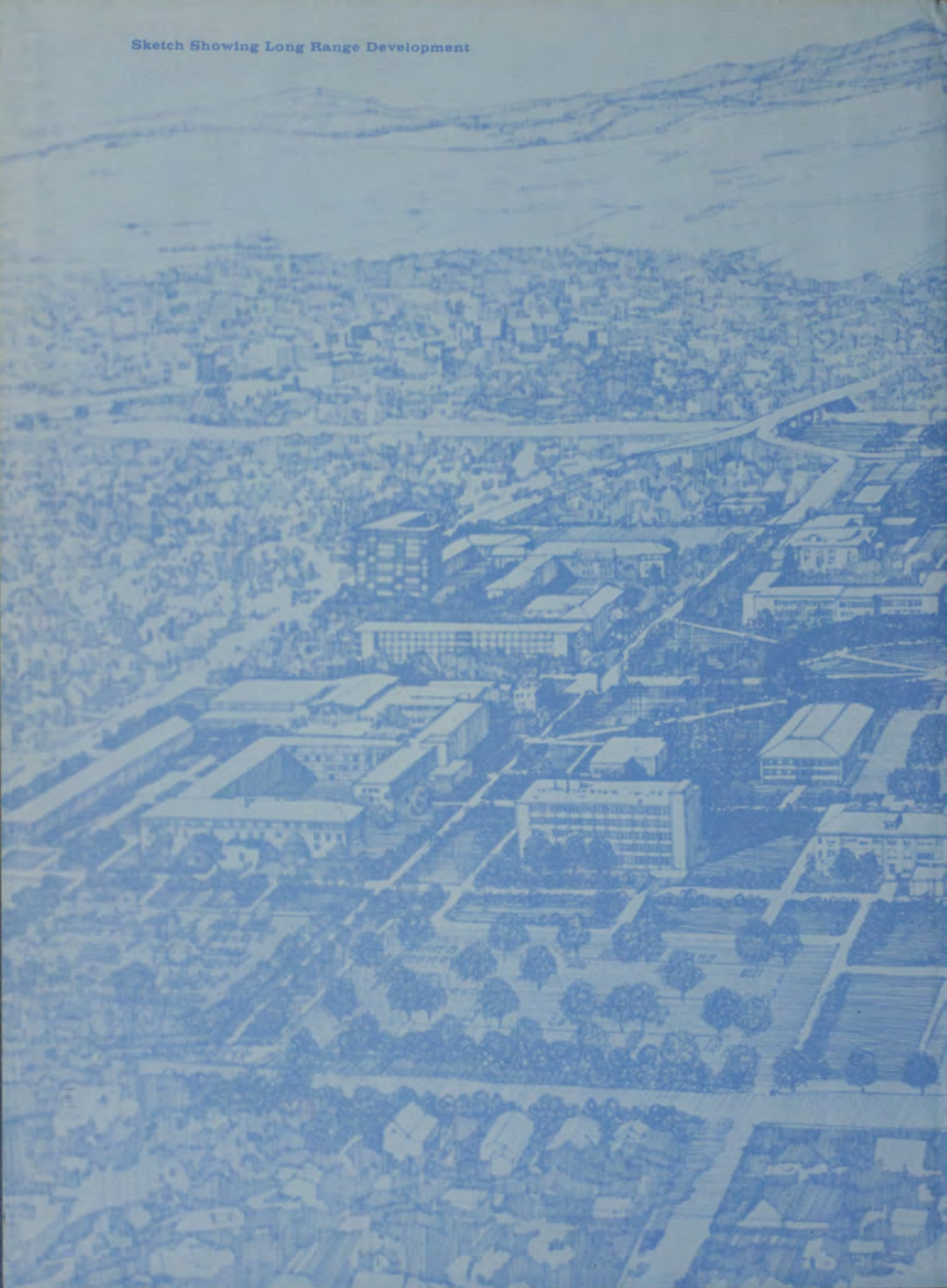
Sketch Showing Long Range Development