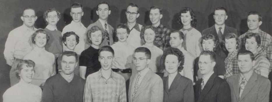
Inter-Denominational Religious Group