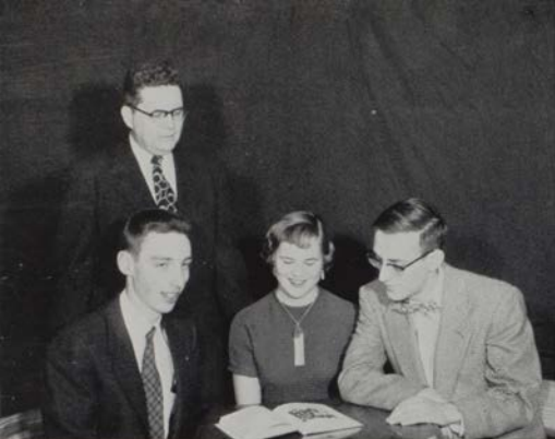
Episcopal Student Group