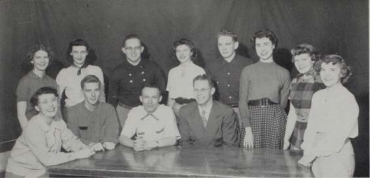
Inter-Faith Projects Group