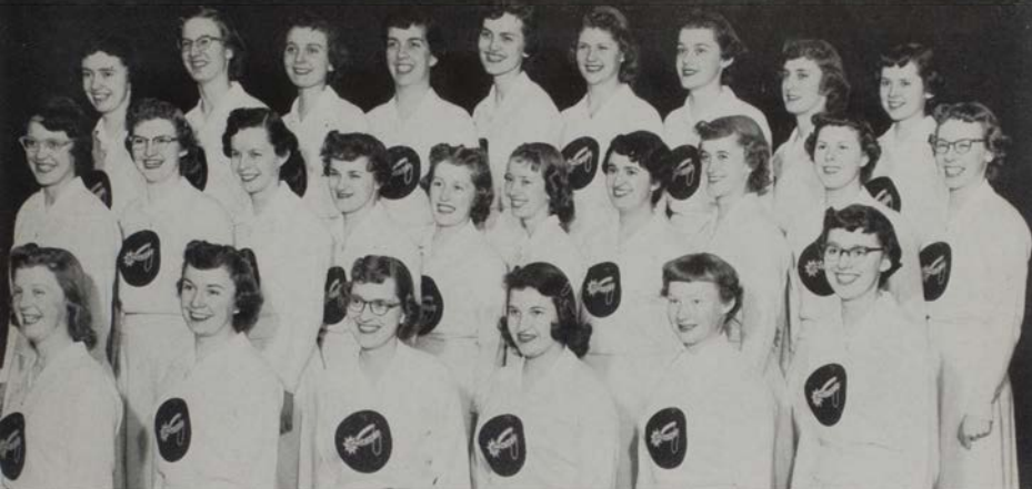
Sophomore Women's Honorary