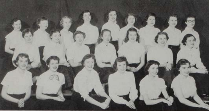
Freshmen Women's Scholastic Honorary