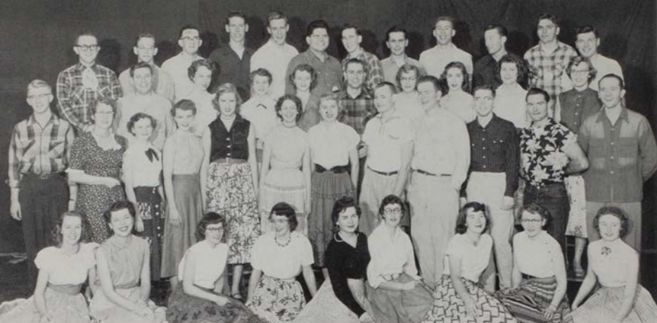
Square Dance Group