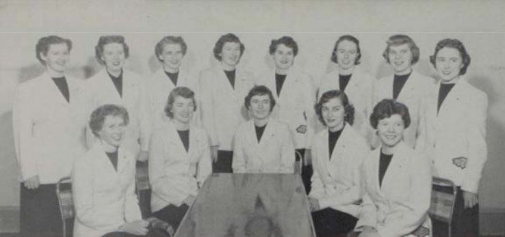
Senior Women's Honorary