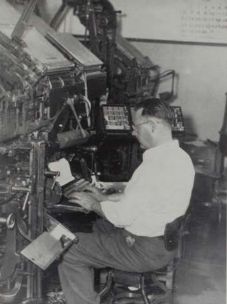
Glenn Chaffin Photographer