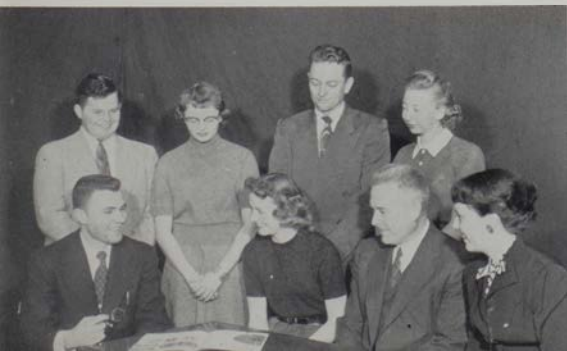
Presbyterian Student Group