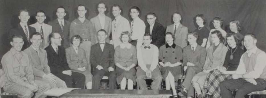
Methodist Student Group