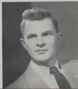
Wallace Norley Composition