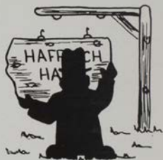
Men's Service Fraternity