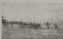
Utah Aggie Game