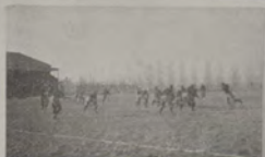
Utah Aggie Winningly ready to start