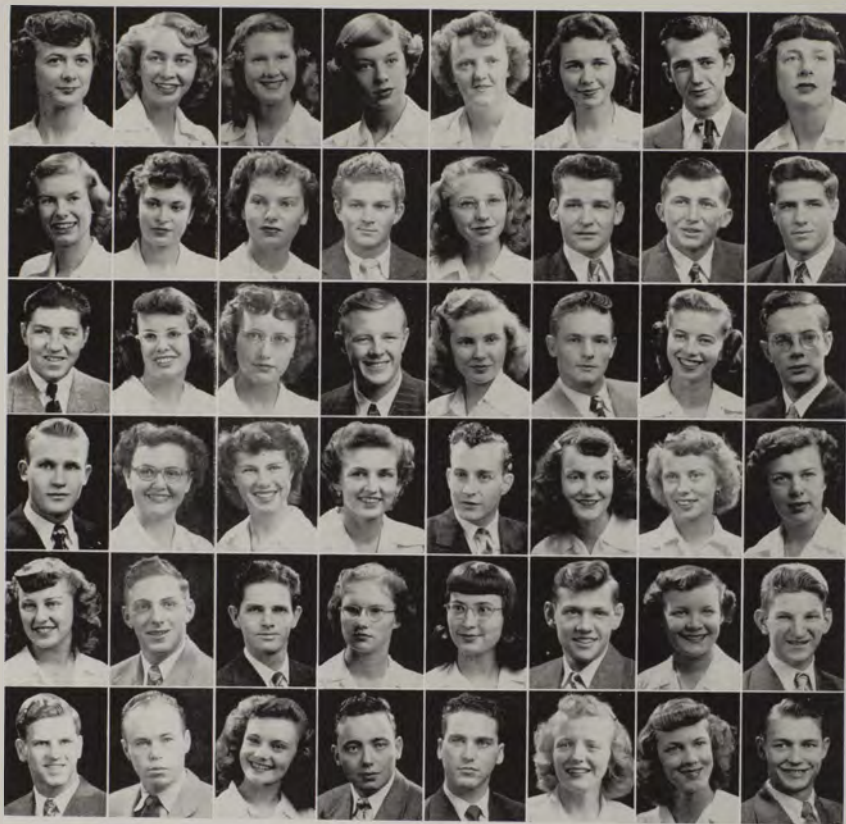
Front row, left to right: