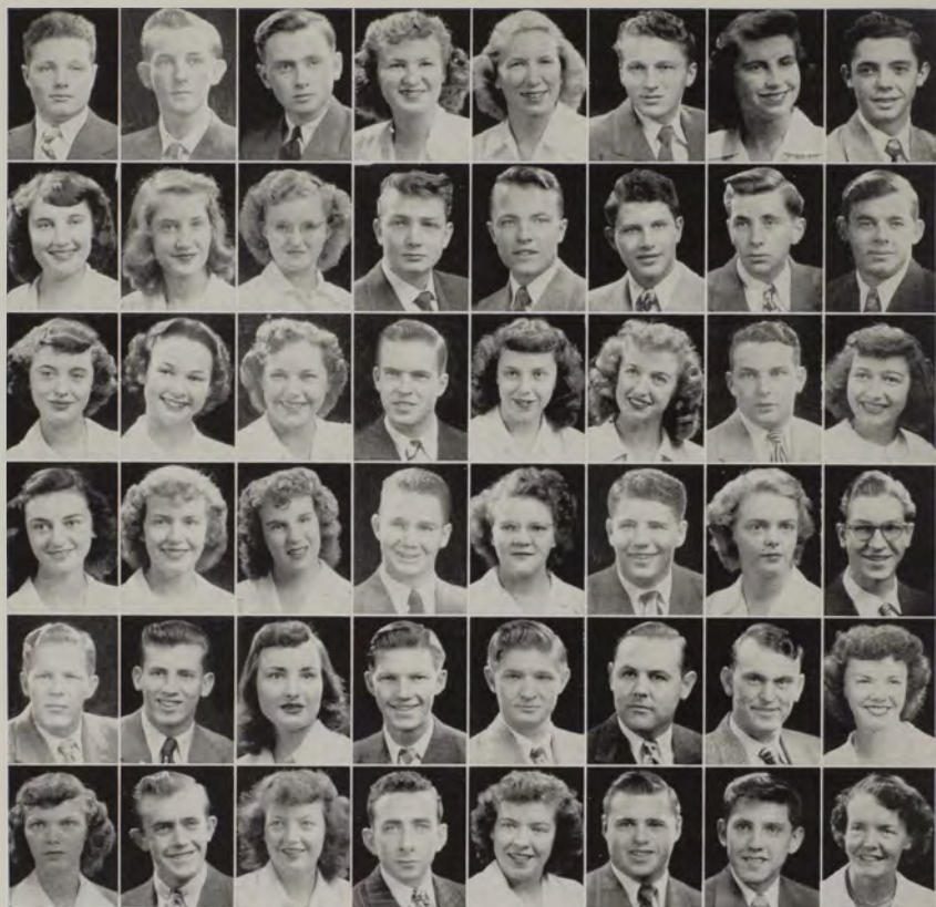
Top row, left to right: