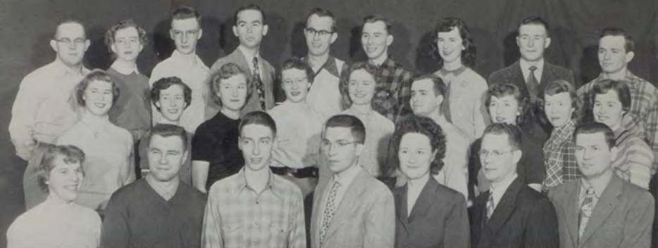
Inter-Denominational Religious Group