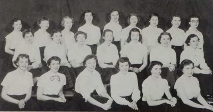
Freshmen Women's Scholastic Honorary