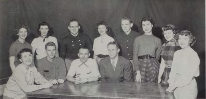
Inter-Faith Projects Group