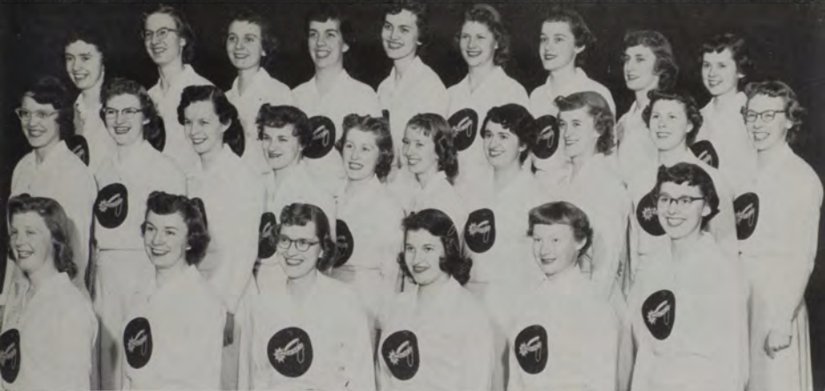
Sophomore Women's Honorary