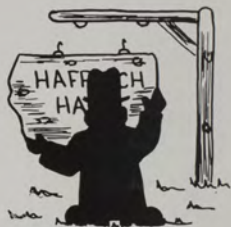
Men's Service Fraternity