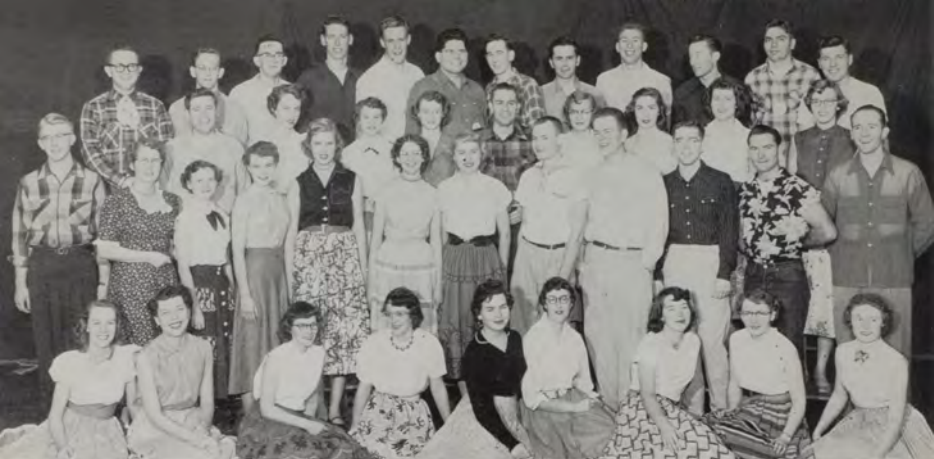
Square Dance Group