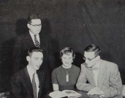
Episcopal Student Group