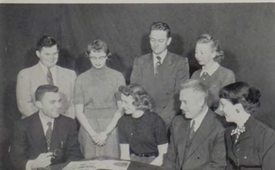
Presbyterian Student Group