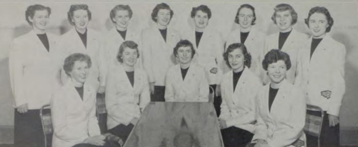
Senior Women's Honorary