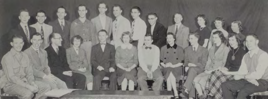
Methodist Student Group