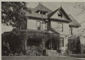
Founded at Virginia Military Institute Lexington, Virginia January 1, 1869 GAMMA PHI CHAPTER Established 1905