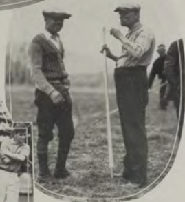
A Couple of Quick Ones