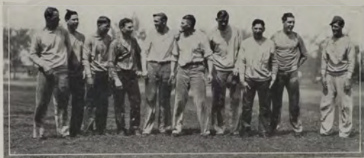
THE annual tug-of-war was lost by this team!