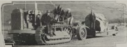
T HE Foresters with the aid of the "Blue Ox" move the Kirkwood Memorial Stone