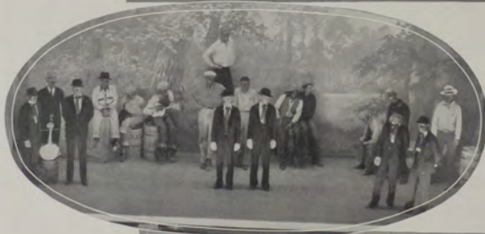
DSL's Alabama Jubilee