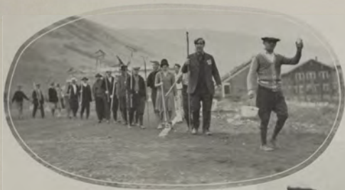
ABER DAY Parade

THIS gang won first prize for acute inertia