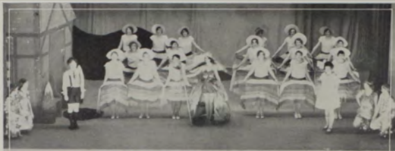
THETA'S Land of the Rainbow