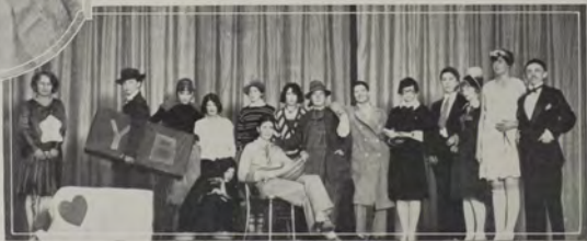
SIGMA KAPPAS win first prize for their stunt