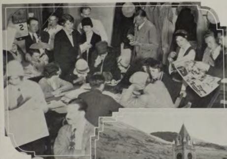
STUDENTS in the "Shack" put out the downtown evening paper