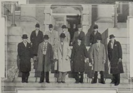
L AWYERS in traditional gart