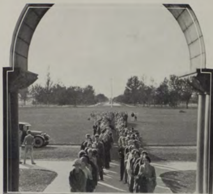
FRESHMEN forming in line for their first registration