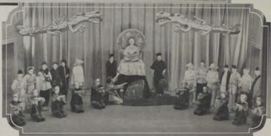
SIGMA Kappa's The Temple of Buddha