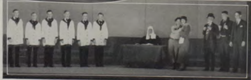
SAE's Jazzy Justice