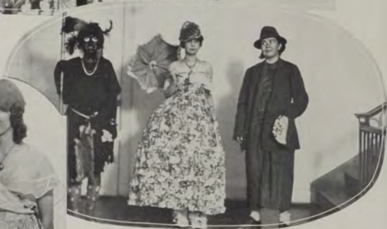
THE Three Best Costumes