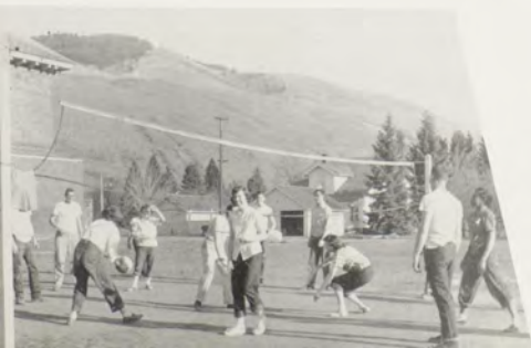
Spring and the volley ball net are in the air at about the same time in back of New—makes for good public relations, too.