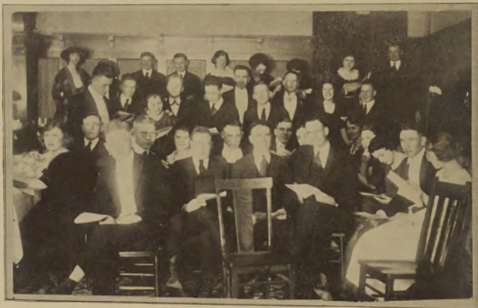
Press Club Banquet.